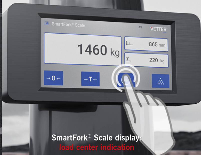
SmartFork® Scale display: load center indication